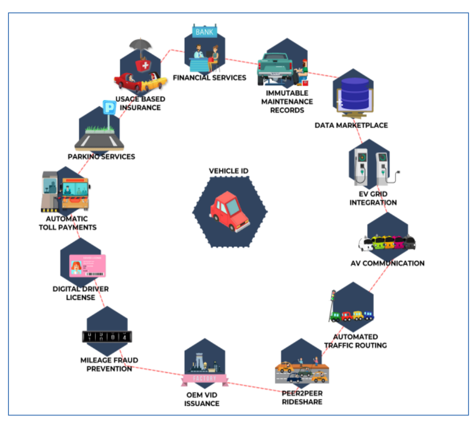
Figure 3. Potential connectivity benefits of a vehicle ID hosted on distributed ledger technology

In July 2019, the Mobility Open Blockchain Initiative (MOBI), which comprises major auto manufacturers, technology firms, blockchain start-ups, and government agencies, made strides toward this goal by launching the Vehicle Identification (VID) blockchain standard. The VID standard seeks to replace the classic VIN, which MOBI finds insufficient for establishing a vehicle's "digital twin" on blockchain (Figure 3) (MOBI, 2019). By creating a VID number compatible with blockchain, any permissioned actor can verify vehicle data in real time by consulting the distributed ledger. MOBI's VID standard focuses on the "birth" of the vehicle, so that it is properly registered to the blockchain from provenance (Pimentel, 2019). This helps ensure that digital twin vehicle data stored on the blockchain is accurate and verifiable, preventing the potential pitfalls of immutability and decentralisation.